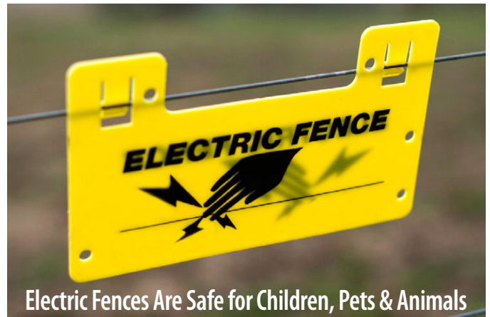
Electric Fences Are Safe for Children, Pets & Animals

Here are two options if your soil does not have enough moisture to conduct electricity. 1) Use an all "hot" (positive) system with a negative grounding apron (see next page) to complete the circuit. Or 2) Set up a positive/negative system , with the top wire and lowest wire as "hot" (positive) ... a bear that tries to go over or under the fence will get shocked.