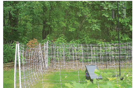
Minnesota Department of Natural Resources

Electric net fencing is an effective temporary solution until a permanent system can be constructed. This Minnesota solar-powered energizer protects a bird feeder and compost bin.